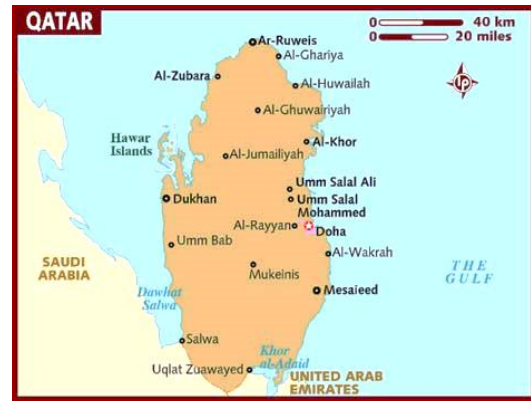
Figure 2 Location of Philippine School Doha at Al Messiah, Doha, Qatar taken from Google Maps

The chosen participants of this study were Overseas Filipino Workers, specifically OFWs having a job mismatch, who are Qatar residents. The selection of the seven participants was made through a qualitative purposive sampling strategy (Creswell and Plano, 2011; Bernard, 2002; Patton, 2002). This is characterized by the incorporation of specific criteria met by the participants at the moment of selection (Padilla-Diaz, 2015). They were chosen considering their occupation and years of stay in Qatar as the researchers believe their insights are constructive because they have witnessed the progress of Qatar as time evolves.