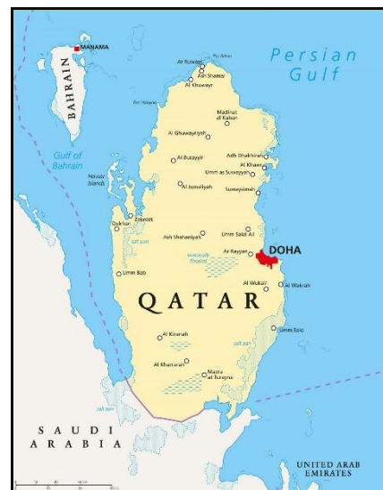
Figure 1 Map of Qatar

This study is conducted at a learning institute founded in Qatar, Philippine School Doha (PSD). PSD has already achieved many accomplishments, and it also has been serving the Filipino community ever since it opened in October 1992. This school selected because of the presence of the accessibility of guidance from their research teacher. The participants for this study were among the students who belong to an interracial family, specifically, students who study in Philippine School Doha. The participants selected through the qualitative purposive sampling strategy. The participants met the criteria created by the researchers. It is according to their nationality and years enrolled in Philippine School Doha.