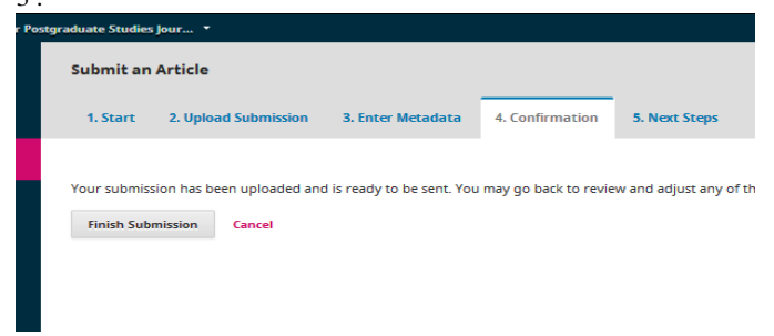
Figure 3: The confirmation step