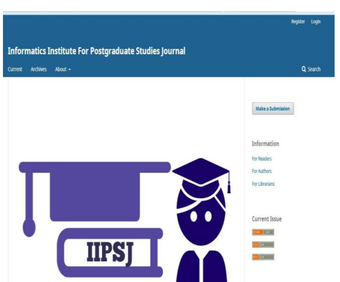
Figure 2: Interface.

is allow this feature in administrator dashboard), Figure 2