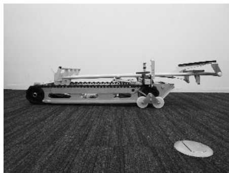
Fig. 2 Developed machine (with backrest frame folded)

The developed machine was provided with a structure that includes a carriage that supports driving, braking, overall load, and a backrest frame that holds and fixes the wheelchair and is operated by a caregiver. The backrest frame section can be folded and stored. The stored state is shown in Fig. 2, and the upright state is shown in Fig. 3.