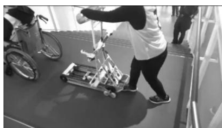
Fig. 7 Raising the back frame

Operation of the developed machine was as follows: Raising the back frame (Fig. 7), Mounting the wheelchair (Fig. 8), Moving on the upper floor (Fig. 9), Descending the stairs (Fig. 10), Moving on the lower floor (Fig. 11), Removing the wheelchair (Fig. 12), and we confirmed that it was able to be operated by just one caregiver.