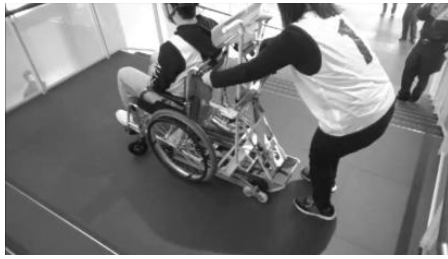
Fig. 8 Mounting the wheelchair