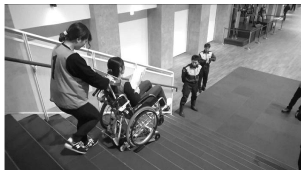
Fig. 13 Stair descent experiment

Stair descent experiments (Fig. 13) were carried out with a total of 9 participants consisting of 6 university students (participant group A) over 20 years old, and 3 fire fighters (participant group B) who operated the developed machine to descend the stairs. The participants performed 18 trials in total, with one participant operating the machine twice while another participant used the wheelchair in turns. The staircase had an inclination angle of 27° and 17 steps, and experiments were carried out through five phases including “Mounting the wheelchair”, “Moving on the upper floor”, “Descending the stairs”, “Moving on the lower floor”, and “Removing the wheelchair”. The operation process was videoed and the time for each phase was totaled. The target time for the operation process was set to 90 seconds.