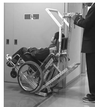
Fig. 1 Preliminary prototype

for residents on the upper floors living in a wheelchair, the possibility of evacuation for such residents could be expanded. We therefore made a prototype of a device that can lower a resident in a wheelchair downstairs with the assistance of just one caregiver (Fig. 1) [3].