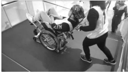
Fig. 9 Moving on the upper floor