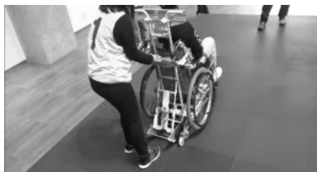
Fig. 12 Removing the wheelchair