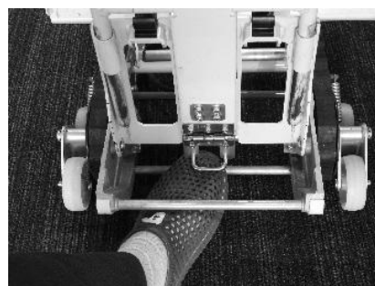
Fig. 16 Unlocking

We examined the results of the stairs descent experiment to find the cause of which “Mounting the wheelchair” accounted for 47.5% of the total processes. The video data of the experiment showed that it took a long time to unlock the section that supports the back frame of the developed machine with the top of the operator’s foot pushed up during the process of mounting the wheelchair (Fig. 16). This was considered to be one of the common factors between the lower scores found in the “Mounting a wheelchair” process and in the opinion of requiring easier handling of the machine in the subjective evaluation results. In addition, about 30 times of use caused a failure in the hinge section with the spring in the lock falling out of position. We thus decided to improve the lock.