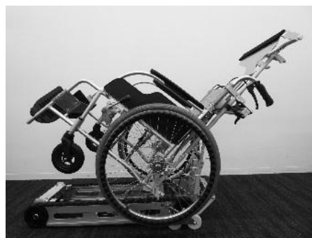
Fig. 5 Mounting a wheelchair (tilting the wheelchair backward)