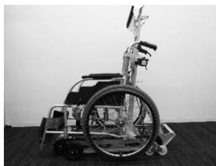
Fig. 4 Mounting a wheelchair

Fig. 4 shows a state where a standard wheelchair is mounted on the developed machine, and Fig. 5 shows a state where the mounted wheelchair is tilted backward. The wheelchair was mounted on the developed machine with the tipping lever of the wheelchair placed on the wheelchair cradle at the bottom of the backrest frame of the developed machine, and the upper backrest of the wheelchair was fixed with the left and right clamps on the backrest frame of the machine (Fig. 6).