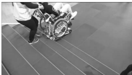
Fig. 11 Moving on the lower floor