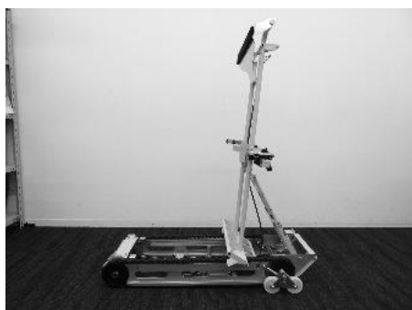
Fig. 3 Developed machine (with backrest frame standing upright)

Fig. 4 shows a state where a standard wheelchair is mounted on the developed machine, and Fig. 5 shows a state where the mounted wheelchair is tilted backward. The wheelchair was mounted on the developed machine with the tipping lever of the wheelchair placed on the wheelchair cradle at the bottom of the backrest frame of the developed machine, and the upper backrest of the wheelchair was fixed with the left and right clamps on the backrest frame of the machine (Fig. 6).