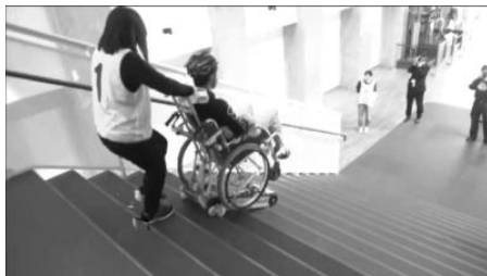
Fig. 10 Descending the stairs