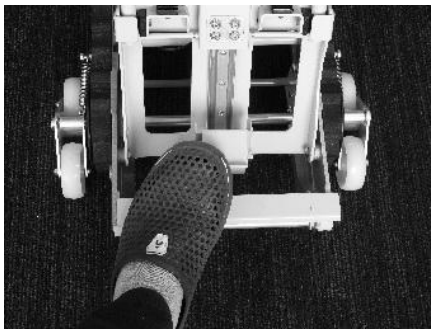
Fig. 17 Improved unlocking process

The lock was improved in response to the results of the stair descent experiment and trial evaluation. The lock was changed to a configuration that can be released by pushing down with the sole of the foot without using a spring hinge (Fig. 17). At the same time, an impact resistance test was performed on the improved machine with a load weight of 115 kg by lowering from the stairs to the downstairs floor 500 times and we were able to confirm that there was no malfunction.