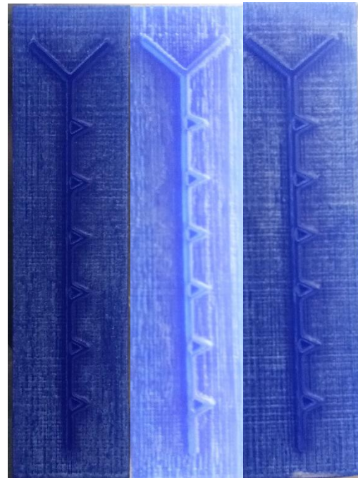
(a) width-04 (b) width-0.5 (c) width-0.6

slower laser velocity and higher laser power. The highest aspect ratio can be achieved. The manufactured micro channel mold for channel shown in below fig. 3.