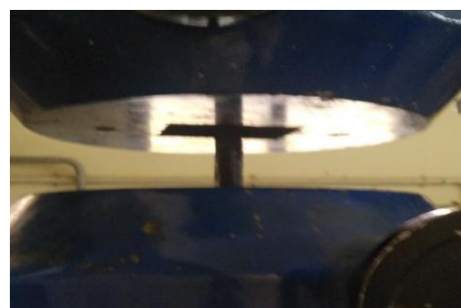
Figure 1. Tensile testing of composite specimens

The prepare specimens were tested for tensile strength using UTM machine (UTK-100E (PC) SR.NO.2011/14 74) of capacity 1000 KN. The figure 1 shows the experimental set up during testing.