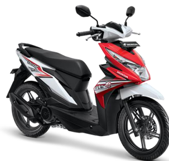
FUNK RED WHITE *tersedia dalam tipe CBS series

However, the purchasing decision remains in the hands of prospective buyers. This purchase decision is aimed at customers who have made a purchase decision and made the transaction, or it can be called an evaluation of the purchase motive that is examined after purchase. This evaluation is closely related to whether consumers are satisfied or not about the products they buy and consume. According to Kotler et al (2007) decision making by consumers is an integration process that is used to combine knowledge to evaluate two or more alternative behaviors and choose one of them.