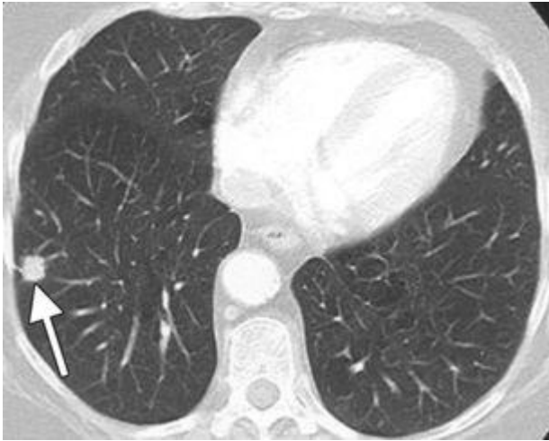
fig 2 TC torax nodules solid