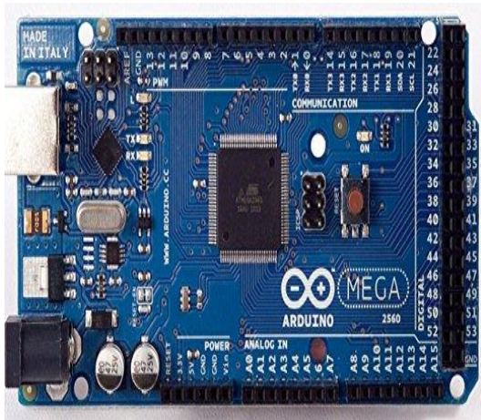
Fig 2. General Structure of Arduino ATmega2560 development board

computer with a USB cable or power it with an AC-to-DC adapter or battery to get started.