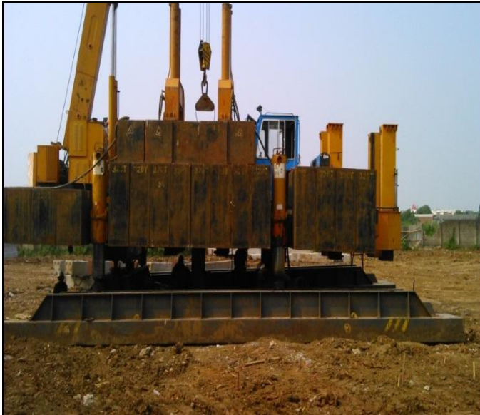
Figure 2. Loads On Counterweigh Beam

5. Clamping Box, This element is a tool to press the pile by clamping and then pressed. For an overview Clamping Box can be seen below: