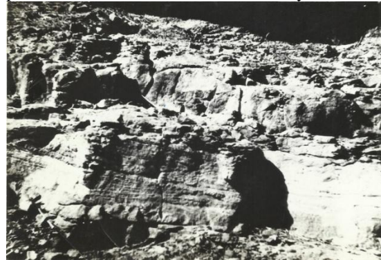
Fig.5: tidal channel sequences. Intrbedded with siltstone and shale.

The swaley cross-stratified subfacies (SCS), in water shallower than that for the S-hcs subfacies and probably above fair weather wave base. In the study area the swaley cross-stratification generally overlies the hummocky cross stratification, suggesting a close genetic link between SCS and S-hcs. In a prograding shoreline sequences, the SCS is directly overlain by shoreline deposits (Komar, 1976), which suggests that SCS may be a storm-dominated structure formed above fair-weather wave base.