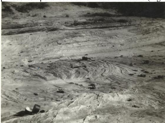
Fig.3: penecontemporaneous deformation structure with fluidized sediment. The laminae are folded.

This subfacies is about 5-10 m thick. The most common primary sedimentary structures within the SCS sand beds are parallel to low-angle cross-lamination, wavy and lenticular bedding, swaley cross-stratification (SCS), and penecontemporaneous deformation. The size of the swale in the structure increases with increasing bed thickness and sand content. The lower portion of the thicker bed show penecontemporaneous deformation structure (Fig. 3).