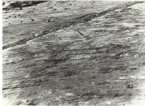
Fig.4: thinly bedded fine-grained sandstone exhibiting parallel lamination and lateral continuity.