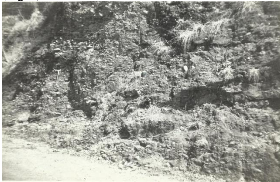
Fig.6: sand matrix supported conglomerate/pebbly sandstone (Cg-S) facies.

Sand matrix-supported conglomerates interbedded with sandstones (Fig. 6) are locally developed in the Surajdeval Formation. Individual beds seldom exceed 0.5-1.5m. Conglomerate may predominate throughout 5m thick succession. Clasts within conglomerates (50mm) are almost all quartzite, with the exception of small sandstones or sandy material (<10-20 mm). clasts are mostly subrounded to rounded and are set in a coarse sandy matrix. Pebbles and cobble are up to 20 cm in diameter have been observed, but 2-10 cm is typically the maximum size. Sandstons that are interbedded with this facies also contain conglomerate layers (Fig. 6).