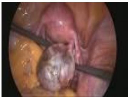
Fig 3: Cisty Ovarian

The specific patient variables that have influenced the surgical treatment such as age, FIGO stage, grading and histology that have been evaluated for statistical analysis. Factors associated with poor prognosis, such as: - The mucinous histology, in most cases the diagnosis is made at an early stage (stage Ia); But in cases of advanced disease often this histological type is associated with a reduced likelihood of response to the line platinum therapy ; - Residual disease after primary surgery (suboptimal debulking) ; - Serum levels of CA125. After radical surgical excision of the CA125 half-life is about six days. The persistence of higher levels the norm in the next 20 days is recognized as a negative prognostic factor. Significant clinical value also holds the normalization time in serum levels during chemotherapy