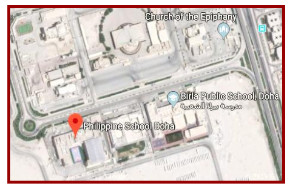
Figure 1 Map of Qatar

The locale of this study is in the state of Qatar, where most OFW's have found a job not related to the course they have obtained. Qatar is considered as a rich country in the world in terms of GDP. Infrastructures and road constructions are in place in preparation for the FIFA tournament in 2023.