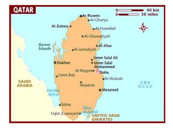
Figure 2 Location of Philippine School Doha at Al Messiah, Doha, Qatar taken from Google Maps

The chosen participants of this study were Overseas Filipino Workers, specifically OFWs having a job mismatch, who are Qatar residents. The selection of the seven participants was made through a qualitative purposive sampling strategy (Creswell and Plano, 2011; Bernard, 2002; Patton, 2002). This is characterized by the incorporation of specific criteria met by the participants at the moment of selection (Padilla-Diaz, 2015). They were chosen considering their occupation and years of stay in Qatar as the researchers believe their insights are constructive because they have witnessed the progress of Qatar as time evolves.