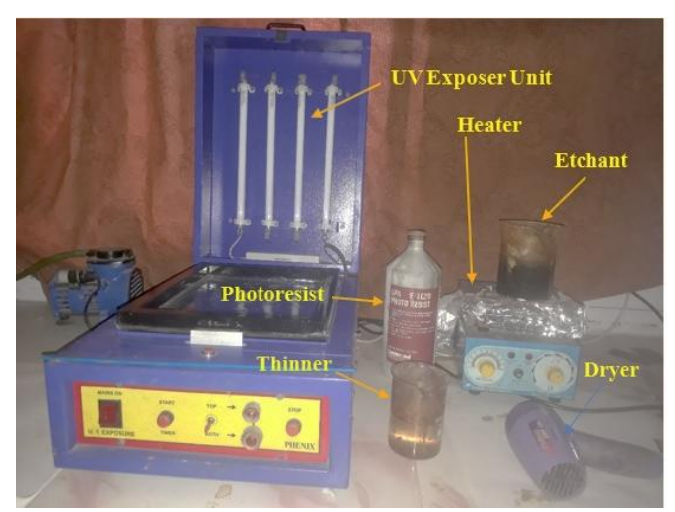
Figure 1: Experimental set up for PCM

The experimentation was carried out for analyzing the effect of concentration of etchant. The concentrations are varied from 300 g/L. to 700 g/L. with an interval of 100 g/L. The performance parameter was the edge deviation.