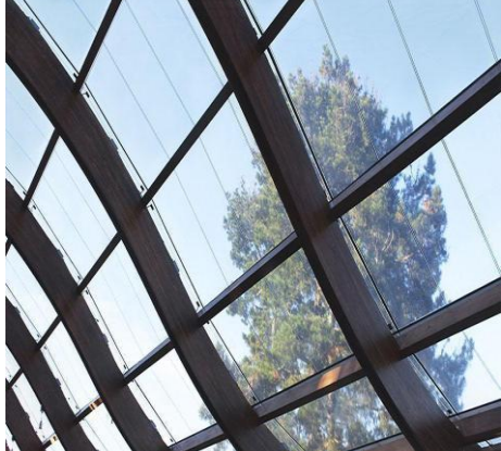
Fig 5: BIPV system