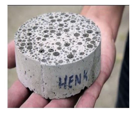
Fig 3: Self healing concrete

.All large-size buildings will defiantly has advantage from the employment of this kind of concrete just as the infrastructure would be enhanced by providing safety and durability.