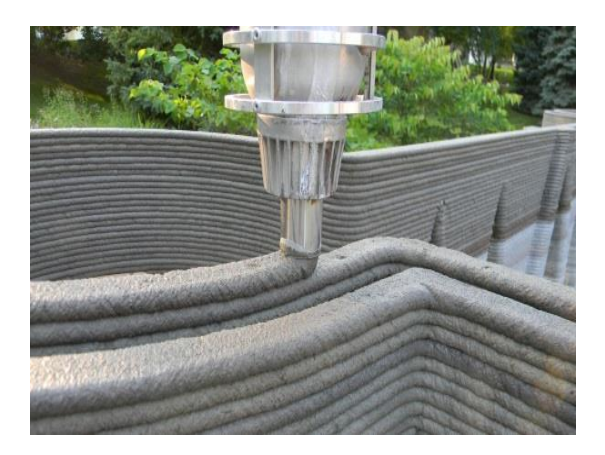
Fig 1: 3D Printing

Construction 3D printing may allow, faster and more accurate construction of complex items as well as lowering labour costs and producing less waste. It might additionally modify construction to be undertaken in harsh or dangerous environments not appropriate for a human workforce such as in space.