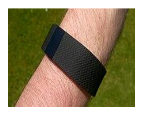
Fig 4: Fitbit, a modern wearable device