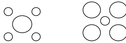
Figure 3 The Ebbinghaus illusion

Object borders carry a lot of information [marr 82]. Boundaries of objects and simple patterns such as blobs or lines enable adaptation effects similar to conditional contrast, mentioned above. The Ebbinghaus illusion is a well-known example two circles of the same diameter in the center of images appear to have different diameters (Figure: 3).