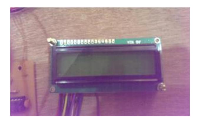
Fig 4. LCD Display