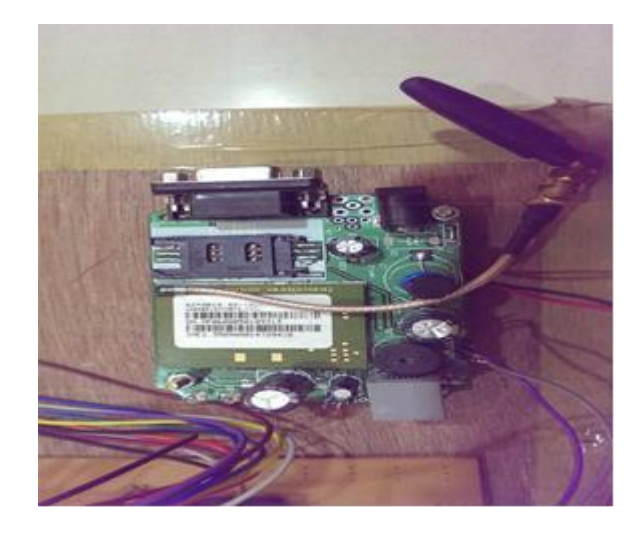
Fig 3. GSM Module