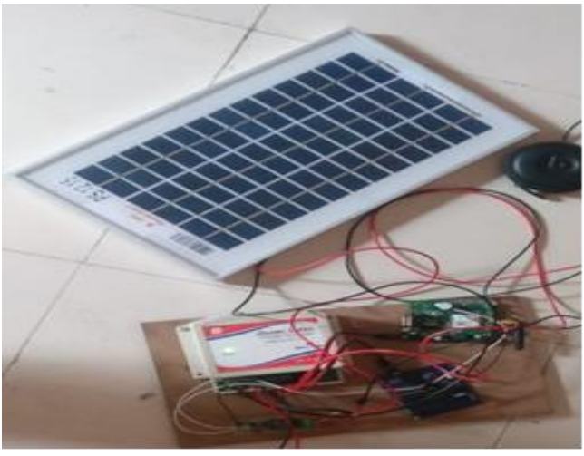
Fig 5. Prototype Design