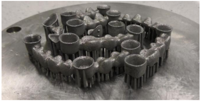
Fig. 1. View of the various prosthetic foundations with supports on the base plate directly after sintering process

The results obtained after SEM (Fig. 4) and after CT (Fig. 5) examinations prove that applied surface treatment parameters are suitable for these elements. The whole process manufacturing of prosthetic foundations and bridges, and oxidation procedure are currently under patent.