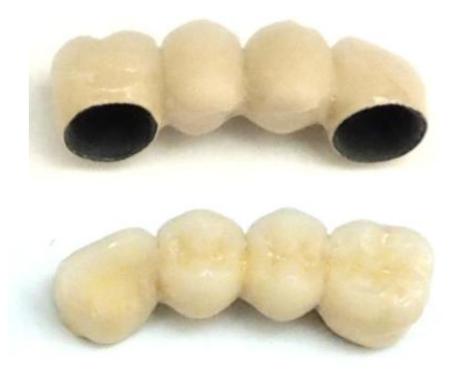
Fig. 6. View of the ready-to-use prosthetic bridge made of Ti-13Zr-Nb with ceramic coating