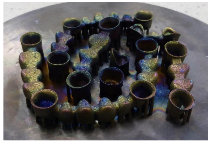
Fig. 2. View of base plate with prosthetic foundations after heat treatment in argon atmosphere