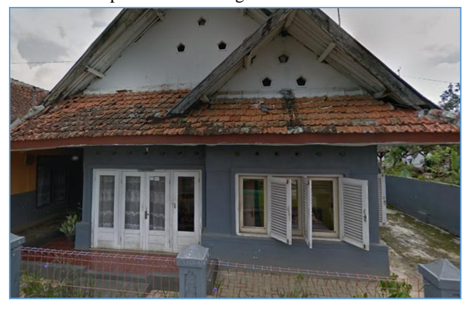
Figure 4. Mrs. Endah house wore a double window on her façade

b. The addition and alteration of the hall or side corridor of the house in the form of lompongan begins to be built. One of the characteristics of Dutch colonial residence, which has a corridor or hallway next to the house, so it can be access side doors. The need for increased space in line with the increasing occupants of the house then the side hall of the house began to be built as an addition of function space in a dwelling.