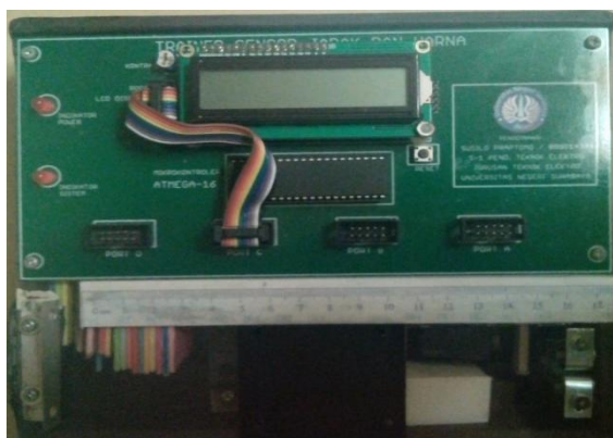
Figure 3. Trainer Sensor distance and color sensor

Trainer proximity sensor and a color sensor tested before being used in learning. The trial results trainers to measure the distance of objects as follows.