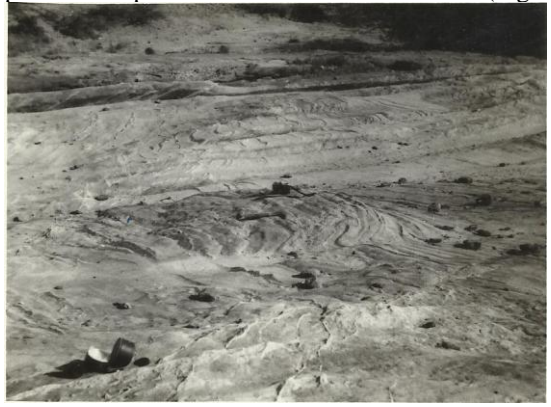
Fig.3: penecontemporaneous deformation structure with fluidized sediment. The laminae are folded.

This subfacies is about 5-10 m thick. The most common primary sedimentary structures within the SCS sand beds are parallel to low-angle cross-lamination, wavy and lenticular bedding, swaley cross-stratification (SCS), and penecontemporaneous deformation. The size of the swale in the structure increases with increasing bed thickness and sand content. The lower portion of the thicker bed show penecontemporaneous deformation structure (Fig. 3).