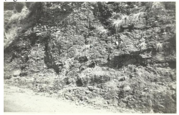
Fig.6: sand matrix supported conglomerate/pebbly sandstone (Cg-S) facies.

Sand matrix-supported conglomerates interbedded with sandstones (Fig. 6) are locally developed in the Surajdeval Formation. Individual beds seldom exceed 0.5-1.5m. Conglomerate may predominate throughout 5m thick succession. Clasts within conglomerates (50mm) are almost all quartzite, with the exception of small sandstones or sandy material (<10-20 mm). clasts are mostly subrounded to rounded and are set in a coarse sandy matrix. Pebbles and cobble are up to 20 cm in diameter have been observed, but 2-10 cm is typically the maximum size. Sandstons that are interbedded with this facies also contain conglomerate layers (Fig. 6).