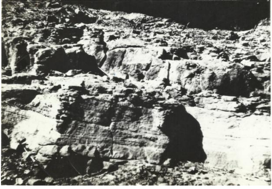
Fig.5: tidal channel sequences. Intrbedded with siltstone and shale.

The swaley cross-stratified subfacies (SCS), in water shallower than that for the S-hcs subfacies and probably above fair weather wave base. In the study area the swaley cross-stratification generally overlies the hummocky cross stratification, suggesting a close genetic link between SCS and S-hcs. In a prograding shoreline sequences, the SCS is directly overlain by shoreline deposits (Komar, 1976), which suggests that SCS may be a storm-dominated structure formed above fair-weather wave base.