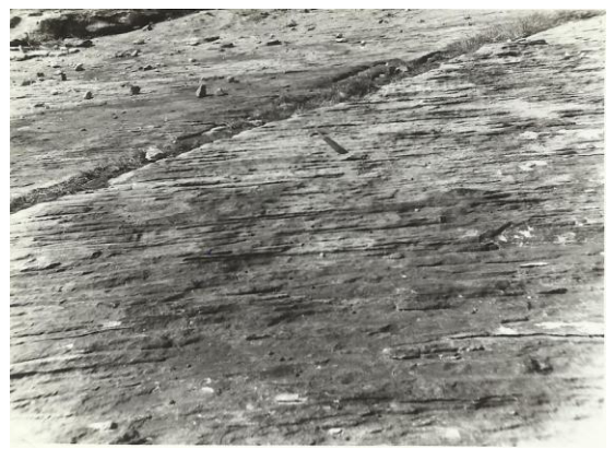
Fig.4: thinly bedded fine-grained sandstone exhibiting parallel lamination and lateral continuity.