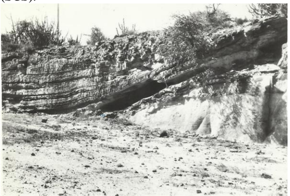
Fig. 2: hummocky cross-stratified bed.

The S-hcs is thick-bedded and sand dominated subfacies, from 2-5 meter thick, sheet-like sand bodies that persist over several hundred of meter in outcrop (Fig. 2). The lithological sequence of this subfacies is composed of medium to fine-grained quartzite which grade up into 15-25 cm thick fine-grained sandstone and siltstones. Bed thickness of this subfacies varies from 0.5-2m. The dominant sedimentary structure is the hummocky cross-stratification. The gentle undulating lamination has wave lengths of 0.5-3m. and heights from swale to adjacent hummocky of a few tens of centimeters. The upper surface of hummocky cross stratification beds show small scale symmetric ripples and, at places, the S-hcs overlies the swaley cross-stratified subfacies (SCS).