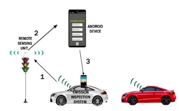
Fig. 1- Proposed System