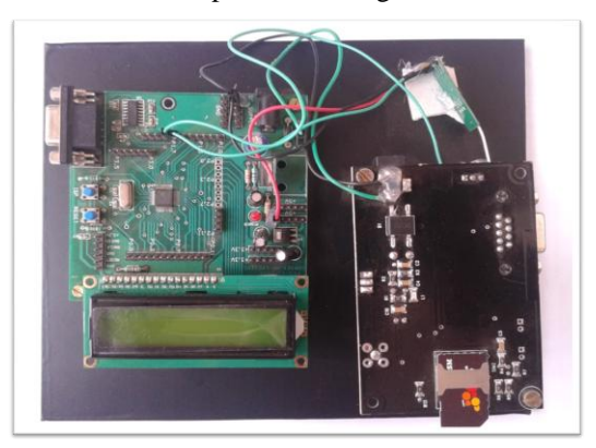
Fig. 3- Prototype of Remote Sensing Unit

number. Then the android device fetches the email address of the corresponding vehicle owner and generates an email which contains the emission data indicating that the vehicle emission is within the set standard limit or not. Along with this emission information, the email also contains the location where the vehicle was interrogated. This location information will be helpful in tracking of the vehicle.