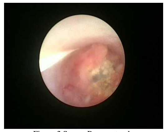
Figure 3 Stones Renoureterale